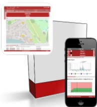
vibras.net Web Monitoring Solution