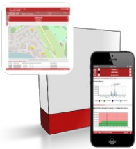
vibras.net Web Monitoring Solution